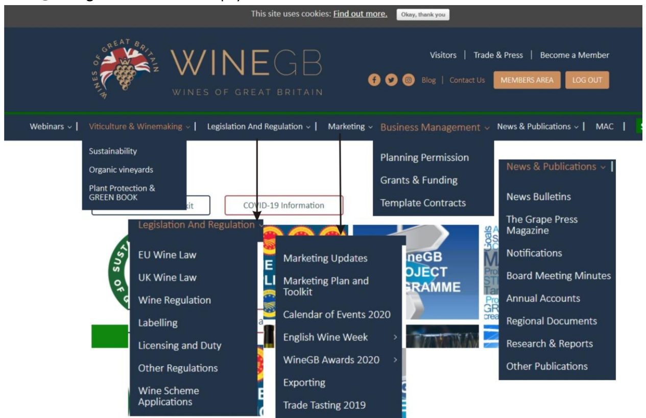
Benefits of WineGB membership

Potential members join via the WineGB website and by contacting the membership secretary at office@ winegb.co.uk . All fees are payable via WineGB.